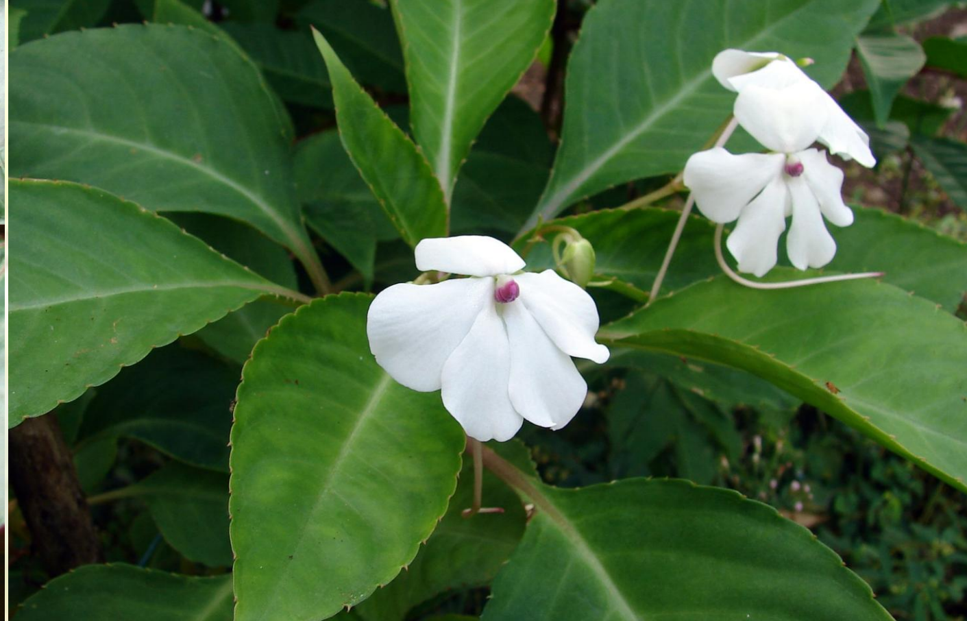
Belzamin Sovaz Impatiens gordonii is a very rare herb. They can be found growing in moist forest on the forest floor.