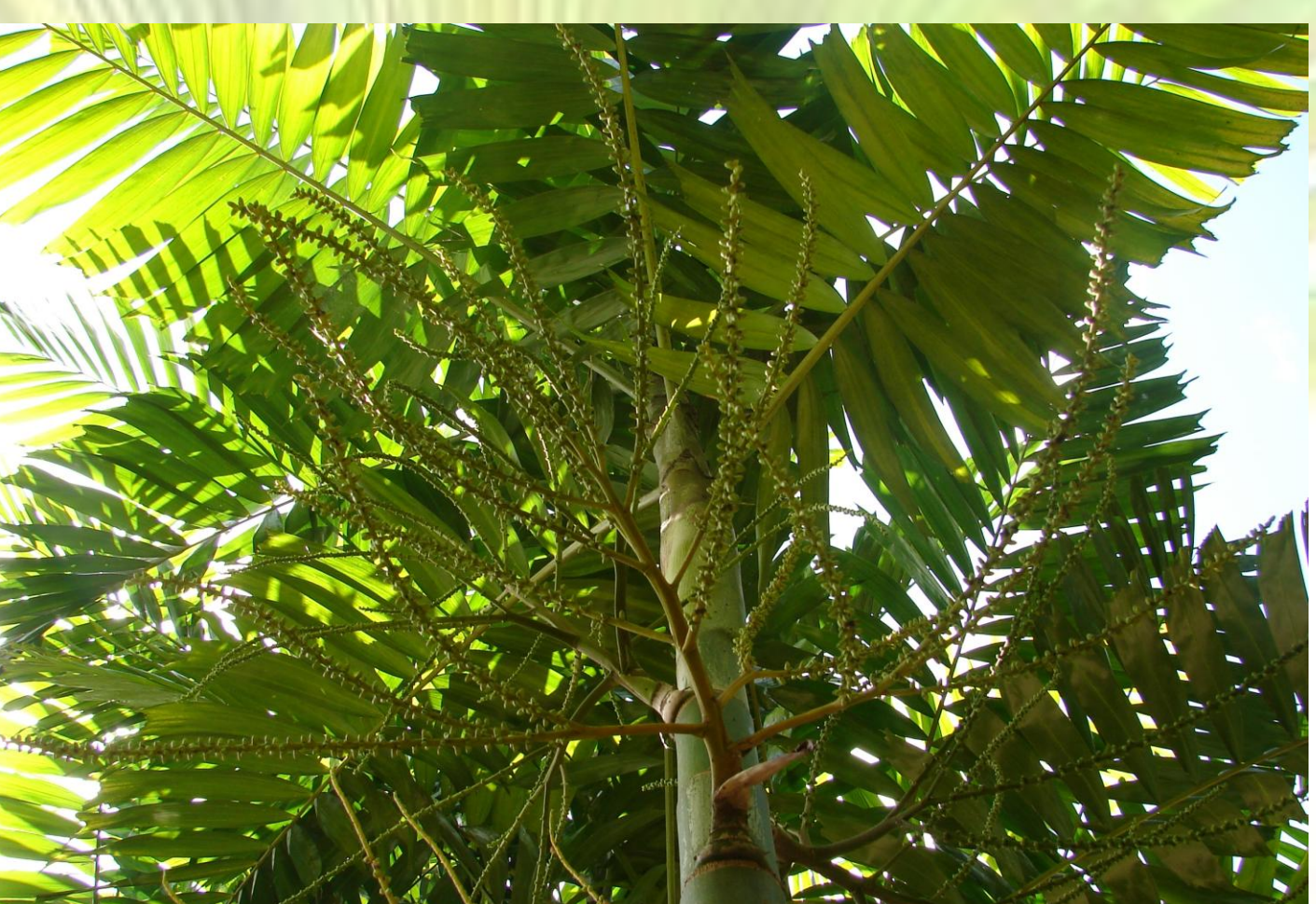
Latannyen Oban Roscheria melanochaetes has a narrow trunk and very large leaves, divided irregularly into leaflets. The flowers are very tiny with yellow colour.