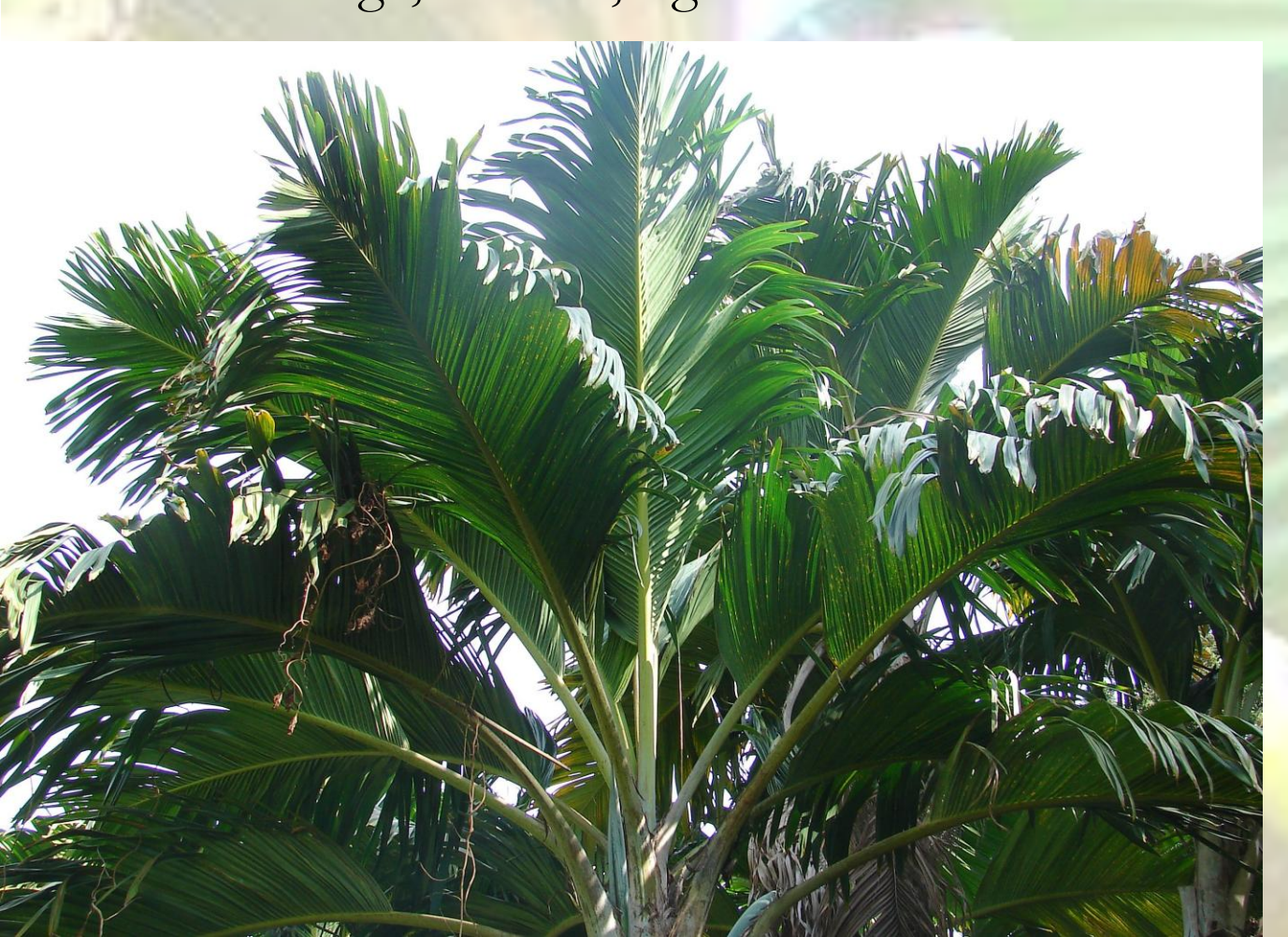
Latannyen Fey Phoenicophorium borsigianum has very large leaves with open tips. It has branched inflorescence with many tiny yellow flowers. It has