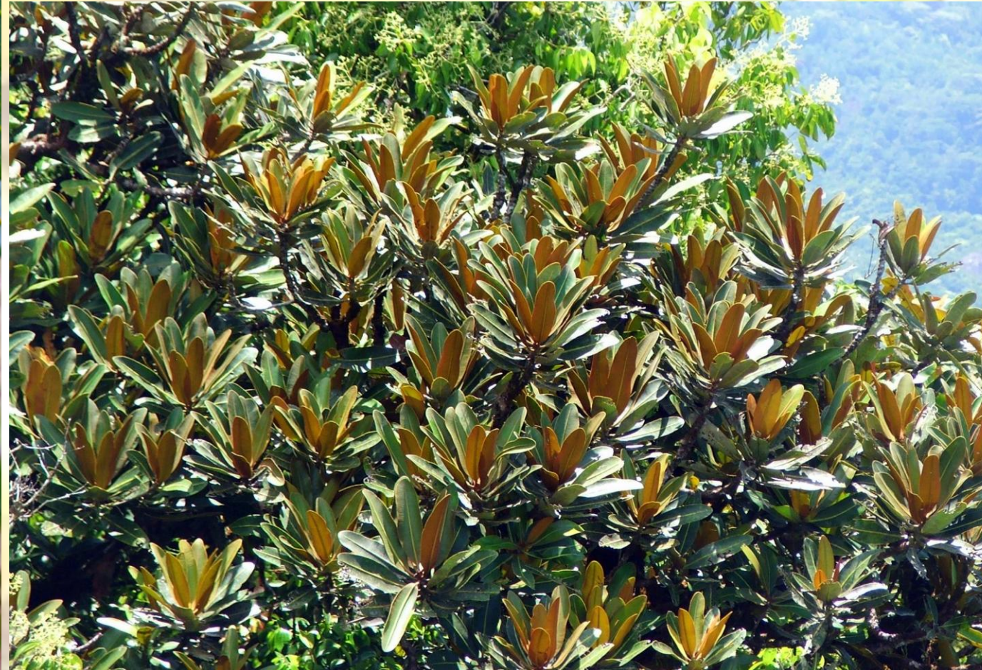
Kapisen Northea hornei is fairly common, can be found at mountain tops. The tree can grow up to 20m.