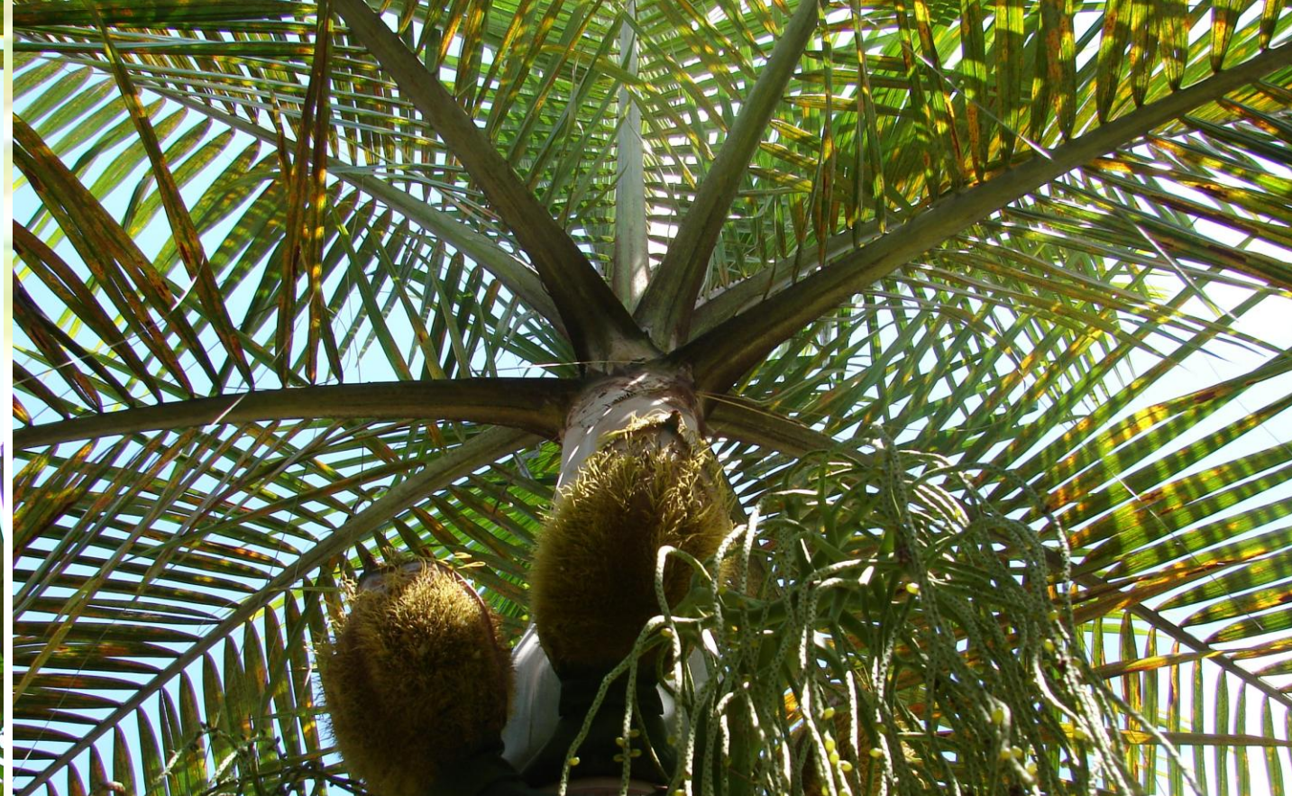
Palmis Deckenia nobilis has very large leaves divided equally into long narrow leaflets. It has long, hanging inflorescence, with many tiny creamy flowers. Immature inflorescence is protected in spiny brackets.