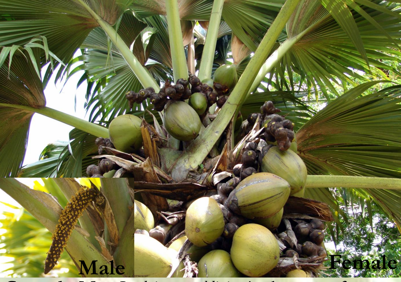
Coco de Mer Lodoicea maldivica is the most famous plant of Seychelles, which has the biggest nuts in the plant kingdom. The biggest nut can weigh up to 20 kg. Male and female flowers grow on separate trees. It has huge, fan-like, rigid leaves.

There are about 850 species of flowering plants in Seychelles, of which, 250 species are indigenous including 75 endemic species (meaning they are found only in Seychelles, nowhere else). The rest are introduced species. Many introduced species have become invasive and put many endemic species in danger. Conservation action is needed to save these special endemic plants. This poster presents some endemic species that are only found in Seychelles.