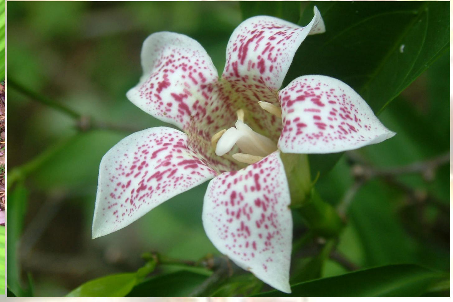
Wright's Gardenia Rothmannia annae is very rare. It is looks like a young coconut. They grow on the forest only naturally found on Aride Island. This plant's flowers are beautiful with a wonderful scent.