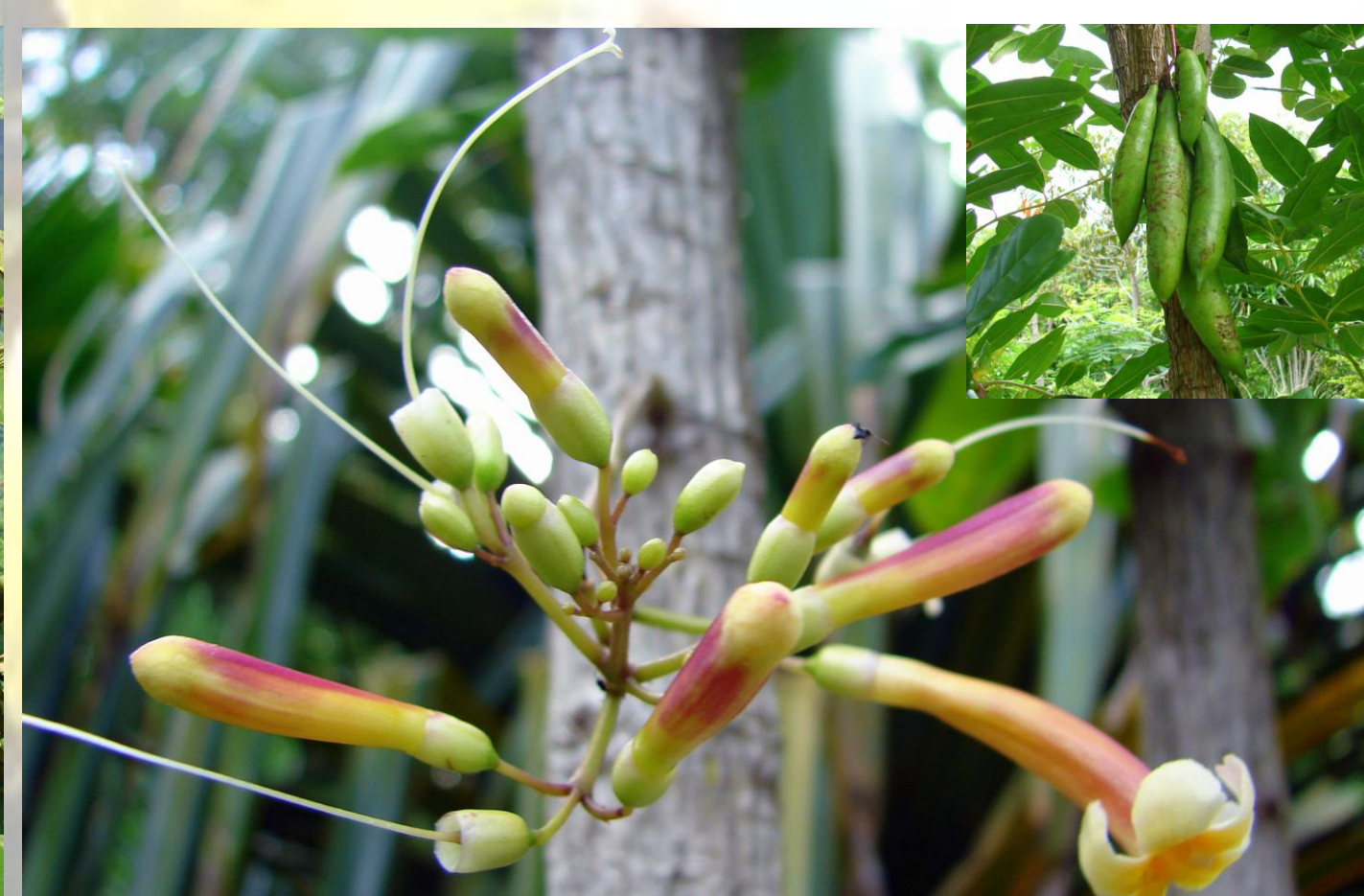
Bilenbi Maron Colea seychellarum is a small tree of about 8-10m high, inflorescence arises directly from the tree trunk. Fruits are juicy look like sausage.