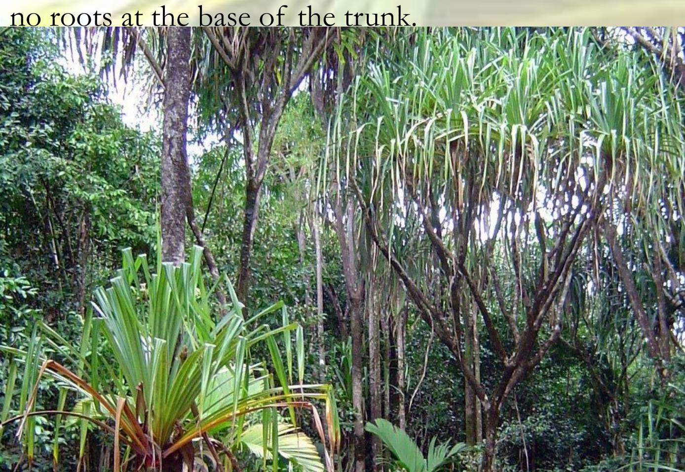
Vakwa Parasol Pandanus hornei is not so common. They can be found in wet upland areas and river ravines.