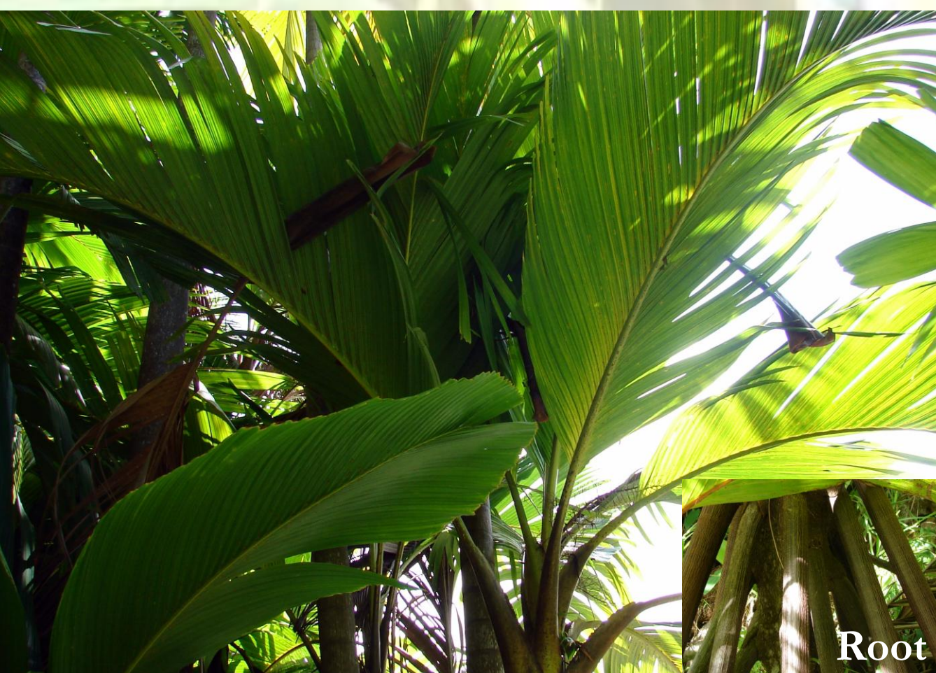
Latannyen Lat Verschaffeltia splendida has a cone of stilt roots at the base of the trunk. Its leaves are very large with an open at the tips.