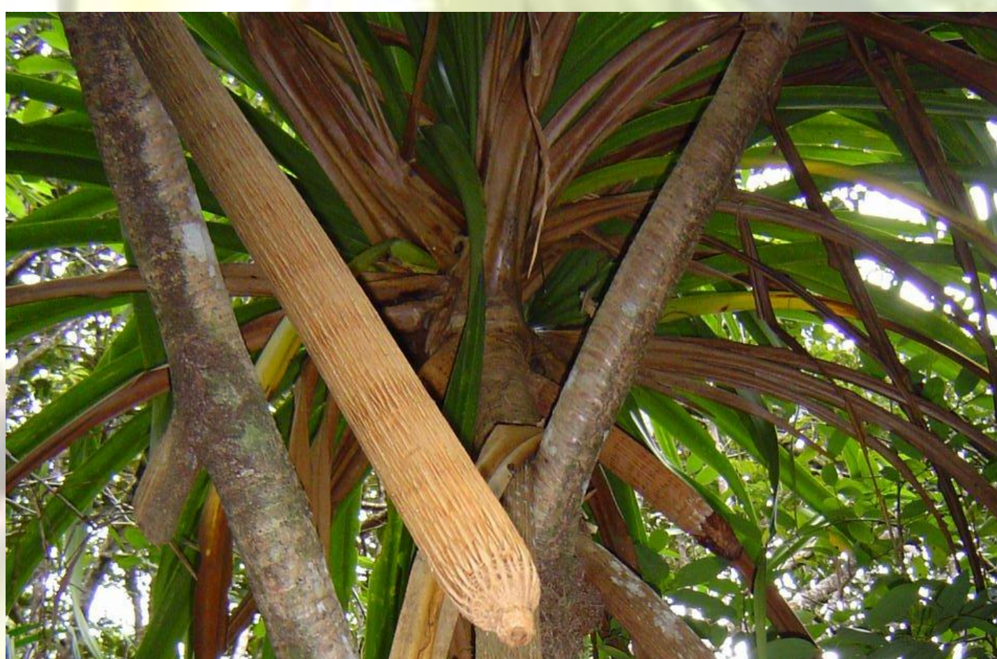
Vakwa maron Pandanus sechellarum is fairly common and can be found in moist forest. Tree has many long roots growing from the main stem.