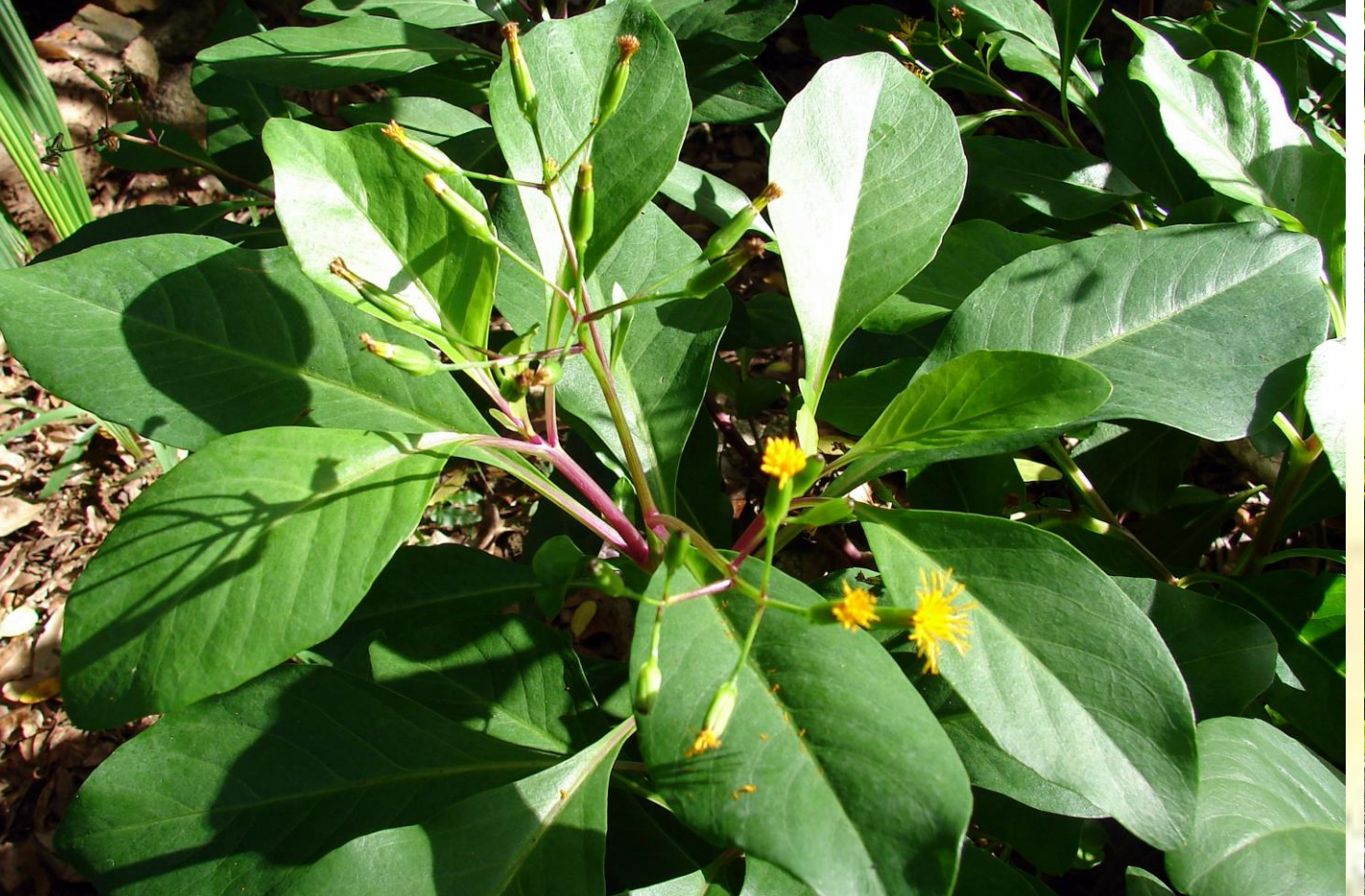
Zakobe Gynura sechellensis is a medicinal herb, used to treat cold and cough by local people by boiling the old leaves and drink the infused juice.