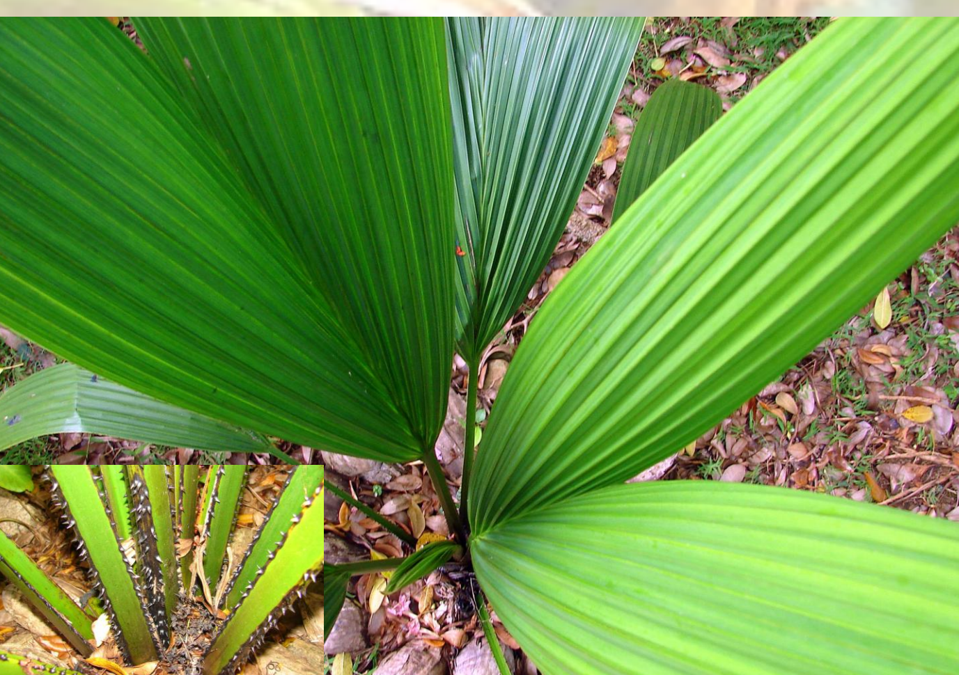
Koko Maron Curculigo sechellensis is a woody herb, floor. Seychellois people often use this plant to make ropes and brooms.