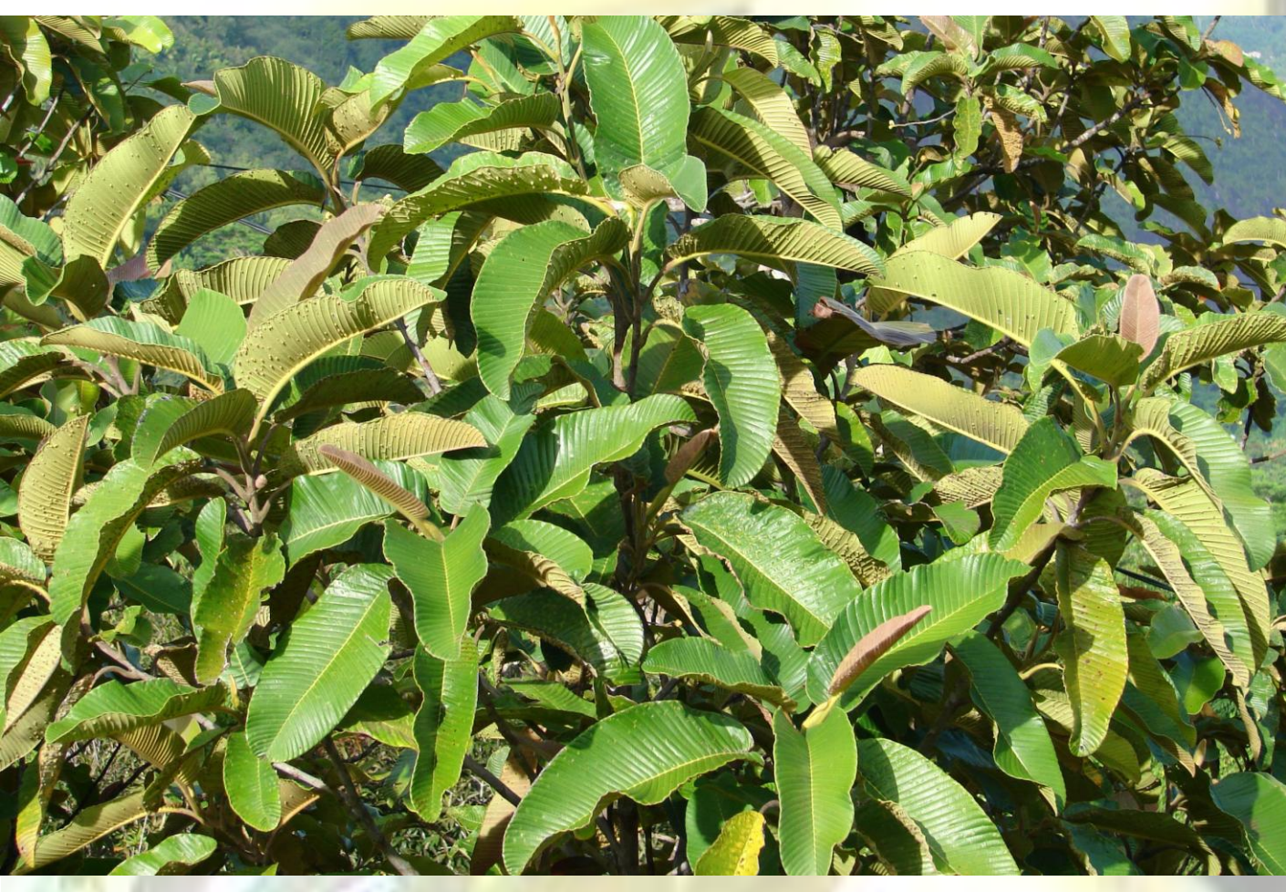
Bwa Rouz Dillenia ferruginea is common and can be found from middle t high altitude forest. The tree can grow up to 20 m.