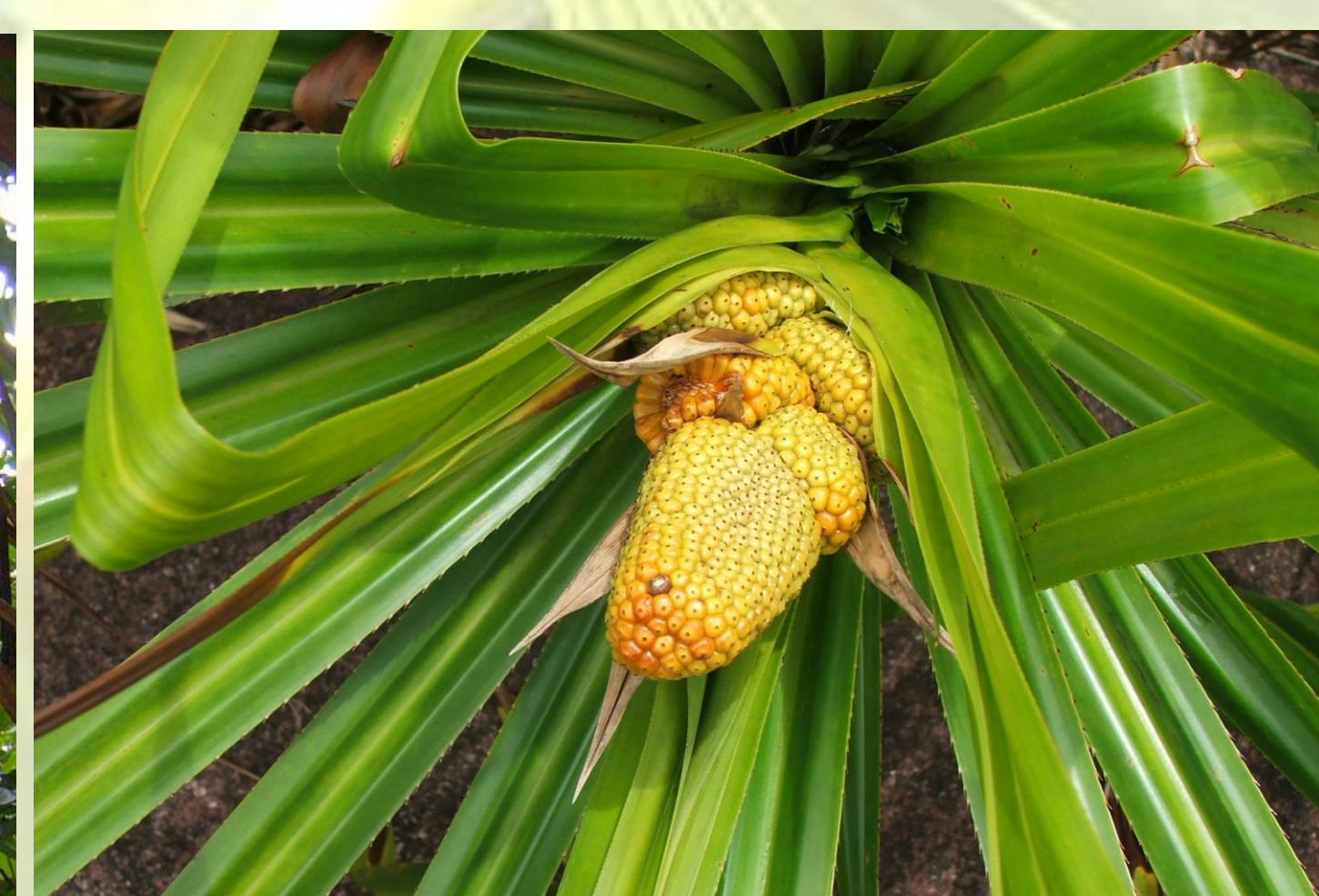
Pandanus multispicatus Vakwa-d-montany commonly found growing on high mountains.