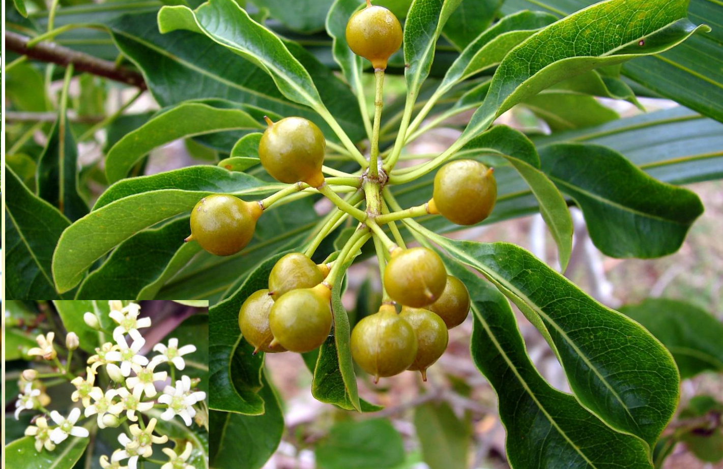
Bwa Zoliker Pittosporum senacia wrightii is a medicinal plan, growing in open woodland rocky areas from 200-500m. Local people use the leaves to treat stomach problems.