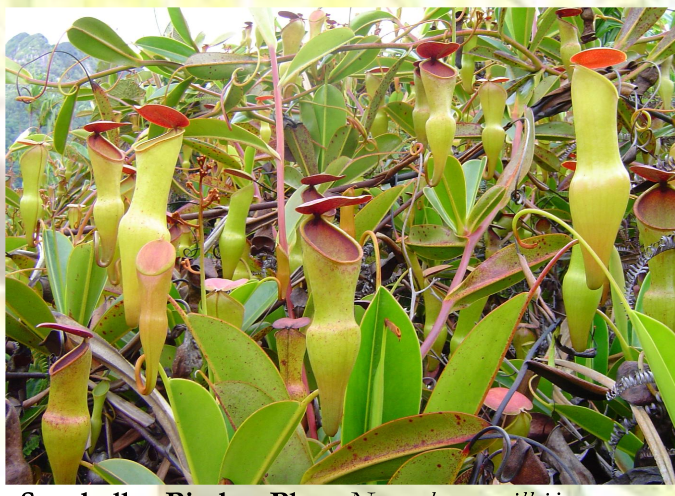
Seychelles Pitcher Plant Nepenthes pervillei is an interesting plant that uses its fluid containing in the pitchers to trap insects for food. The lid of the pitcher is open when the pitcher is full with fluid, and keeps the rain water from getting in.