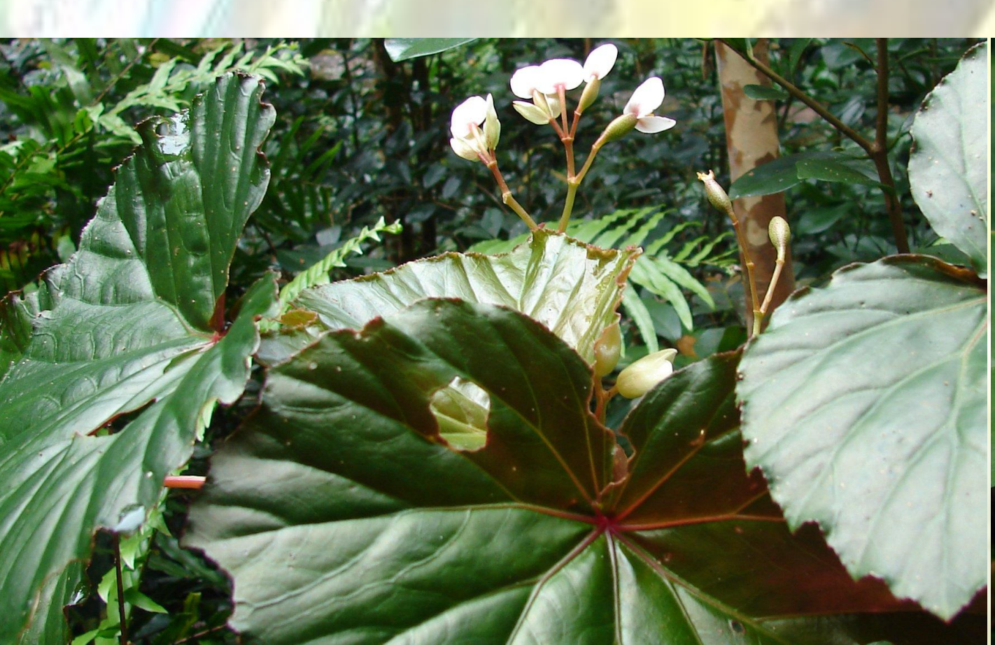
Lozey maron Begonia sechellensis is a herb, not very common, and can be found moist forests above 500m.